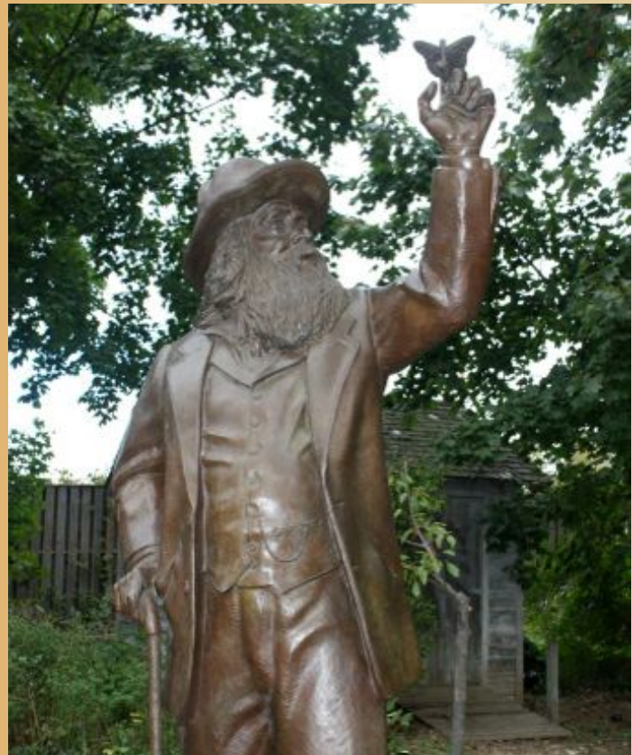
The commanding bronze statue, Whitman with Butterfly , beckons visitors to the courtyard at the Walt Whitman Birthplace.